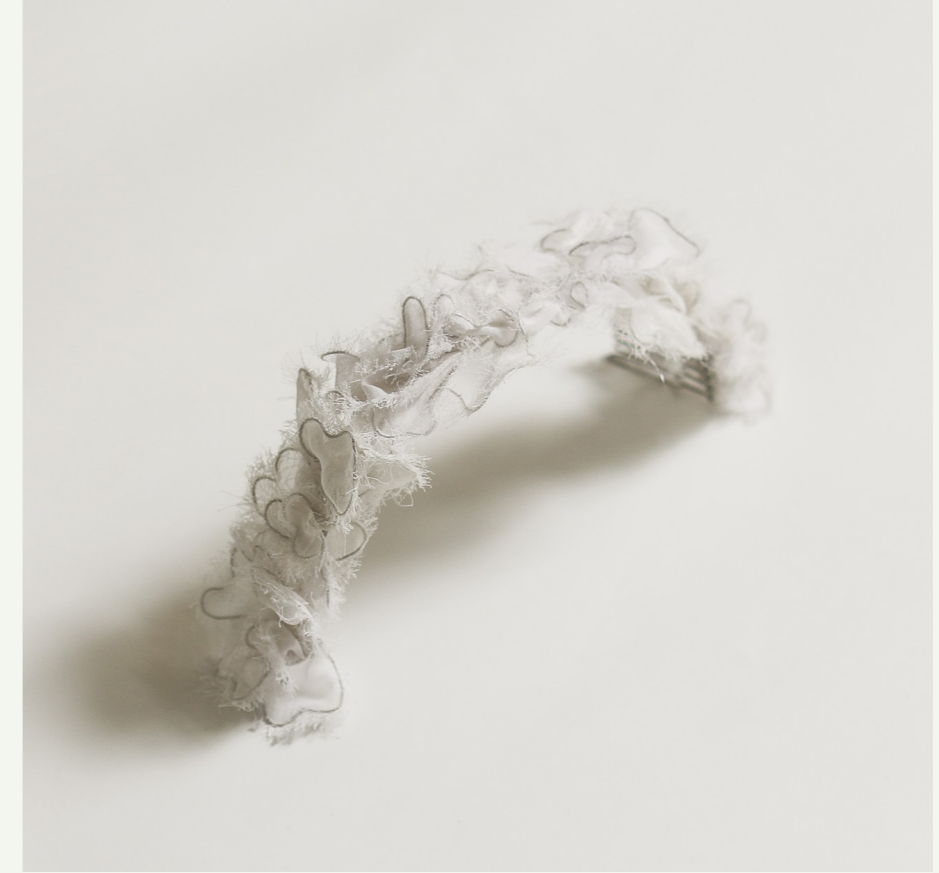
organza headpiece adina crown lola headpiece