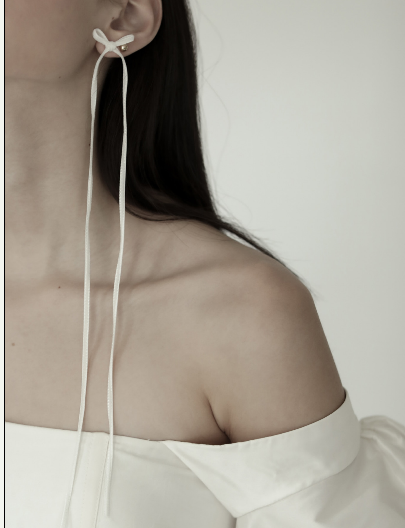
lana bow studs lana bow strands