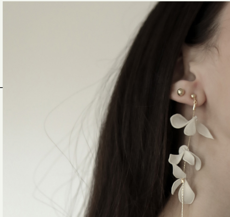
mini nora tier nora strands nora tier vaugh floral ear cuff