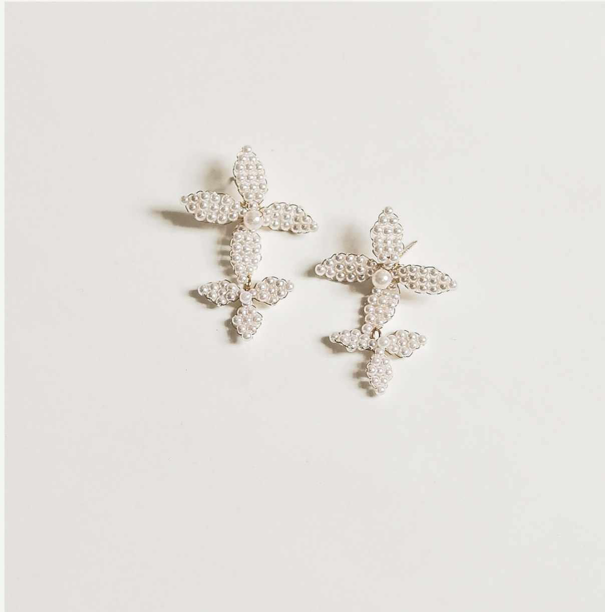
mini harlow drops harper strands