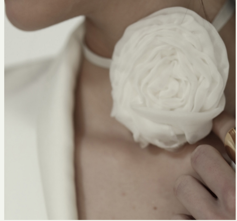
rosario choker rose necktie viola cuff