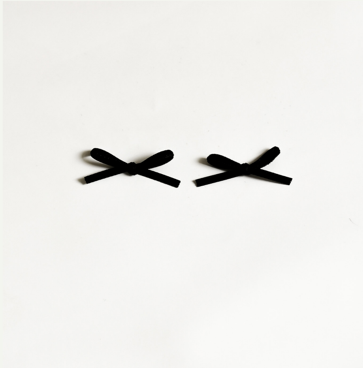
moody lana bow studs moody lana bow strands