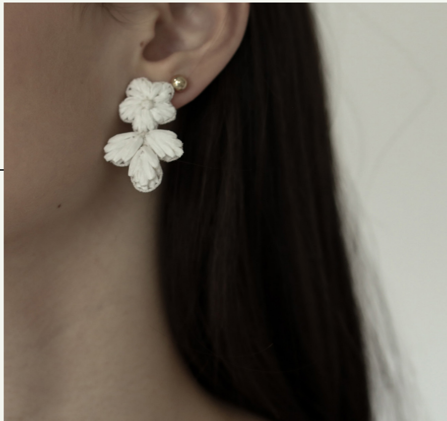
stevie earrings mini stevie dylan raffia studs stella raffia studs