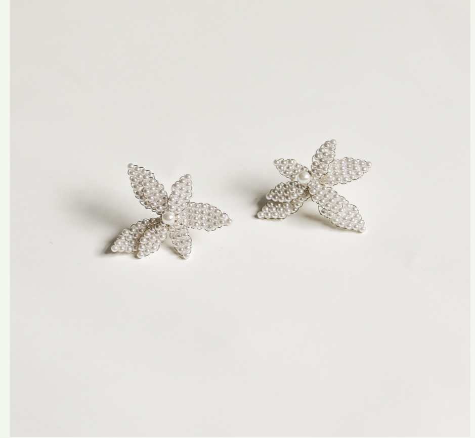
harlow earrings hayden studs xs hayden studs