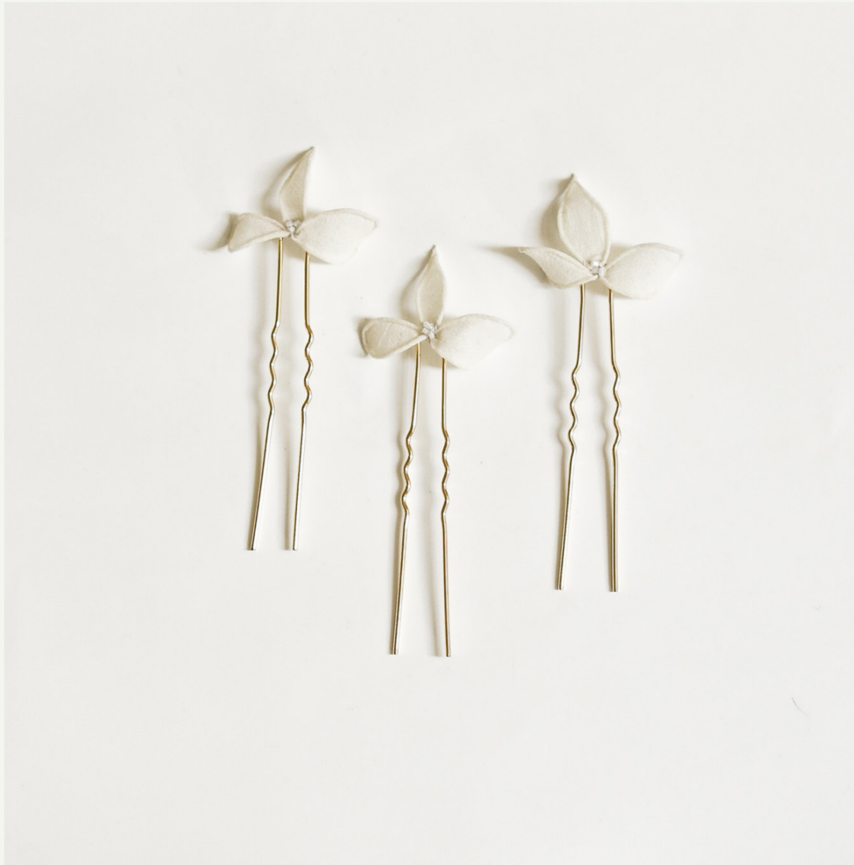
nora hairpin trio harlow hairpin trio