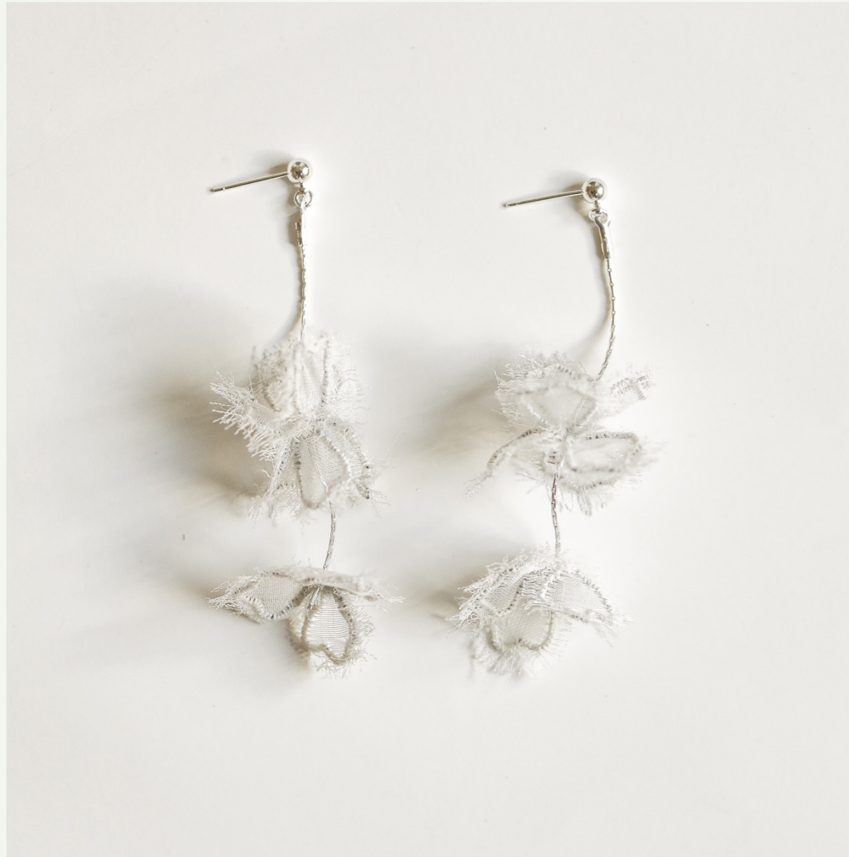
adina strands adina studs