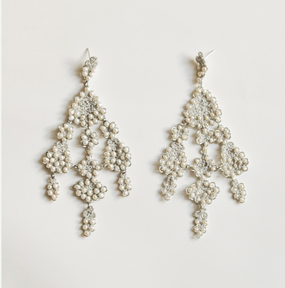
mini margot chandelier melrose drops