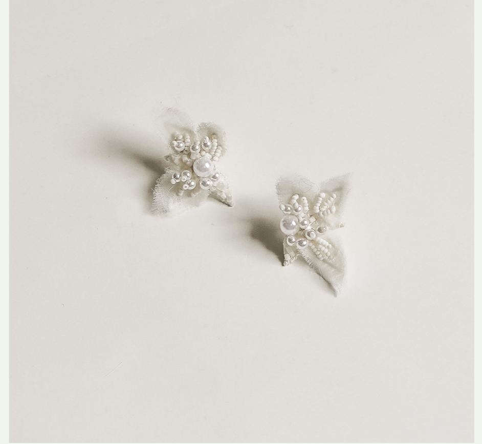
layla drops mini lexi studs lola tier earrings