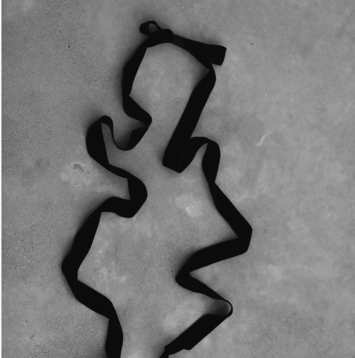
moody juliette bow lana satin bow headpiece