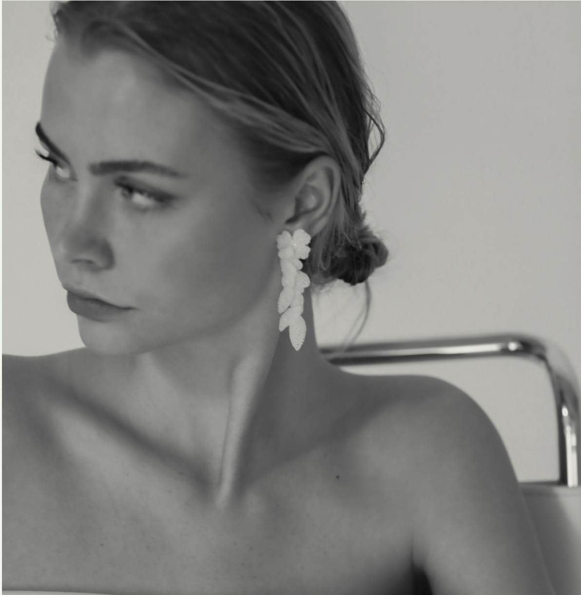
maj tier earrings maj studs