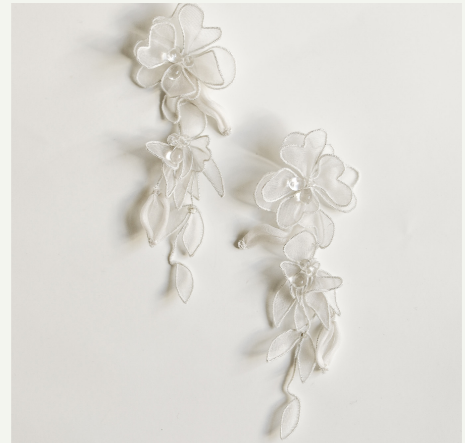
mini charlee tier charlee floral drips charlee studs