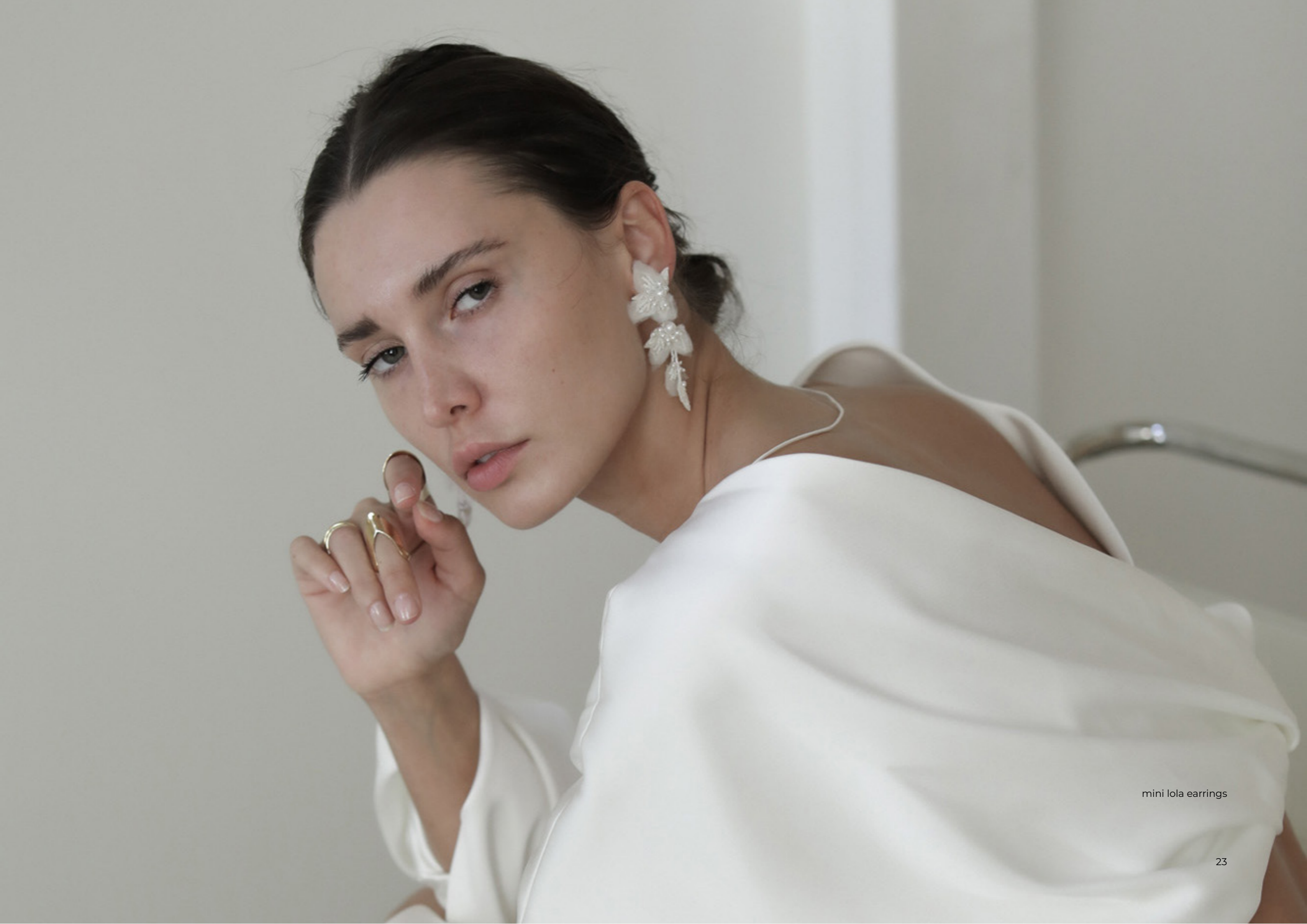
mini lola earrings