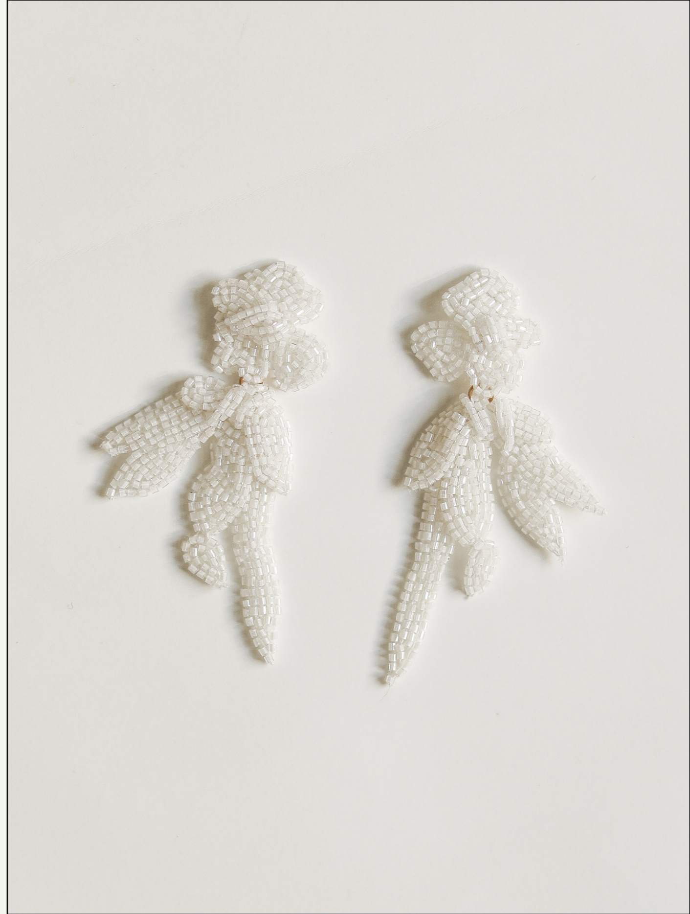
mari drops mini maj drops